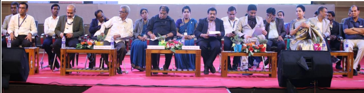
Dignitaries on the dias for Offer Letter Distribution Ceremony