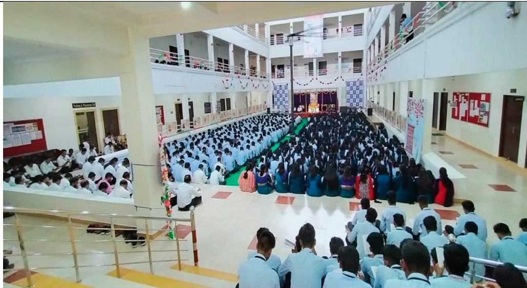
Glimpses of stotra pathan of Sant Gajanan Maharaj every year on the Occasion of Rushi Panchami and Pragat Din