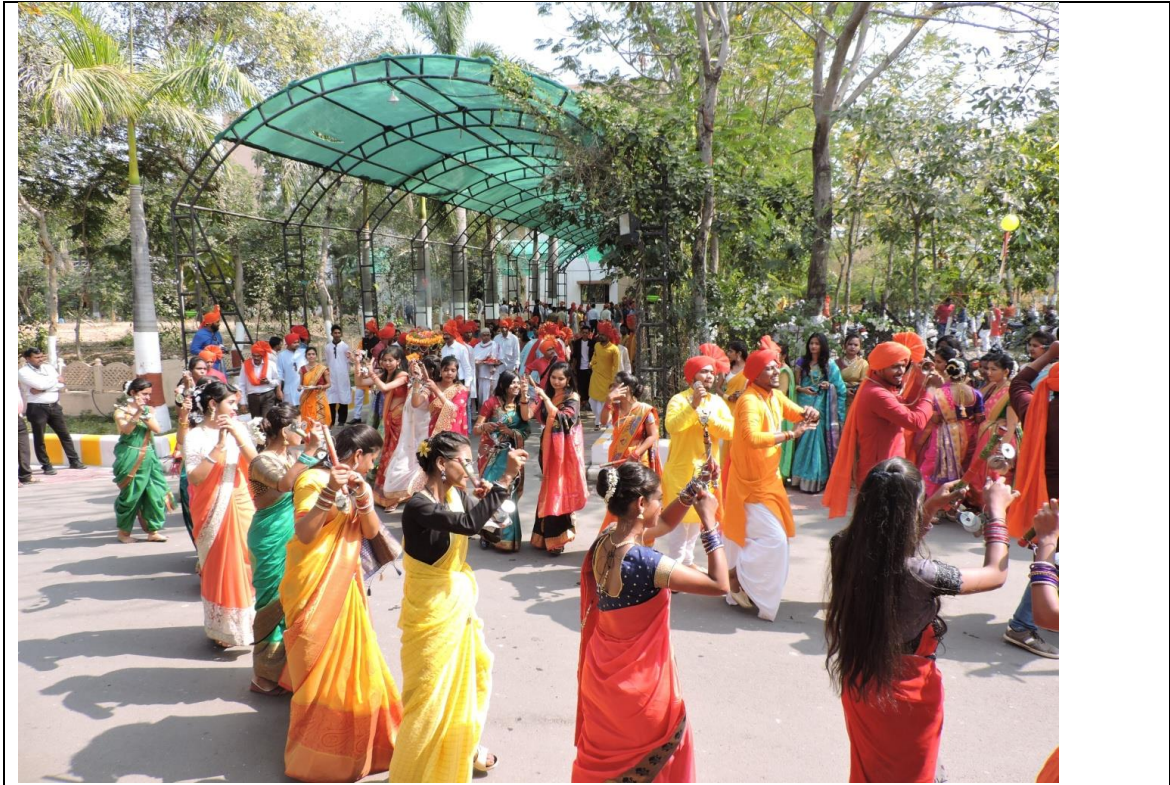
Students and Staff enjoying LEJIM “the traditional play of Maharashtra”