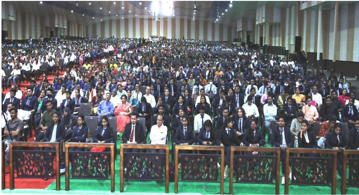
Parents, Teachers, Stuednts in huge numbers present in the Auditorium of P R Pote Patil College of Engg and Management, Amravati, on the occasion of Offer Letter distribution ceremony.