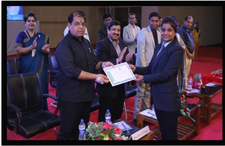
One of the Student being offered a Offer letter by Chairman, P R Pote Patil College of Engineering and Management, Amravati