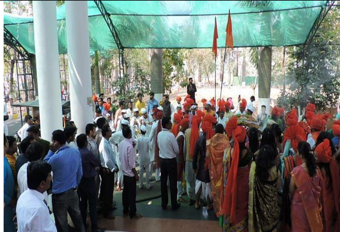
Welcoming the Dindi by the Principal at the Main Door of the Main Building