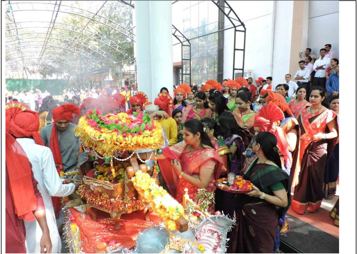
Welcoming Dindi at the Main Door by the Ladies Faculties and doing Arti of Gajanan Maharaj