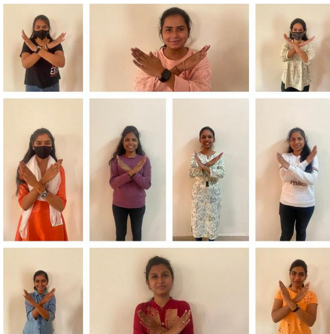
Sample photos uploaded on social media platform

4. #Break The Bias: All the students were informed to participate in #BreakTheBias theme in which they had to click their own photograph with crossed hands position and upload it to their social media account and tag our college in it.